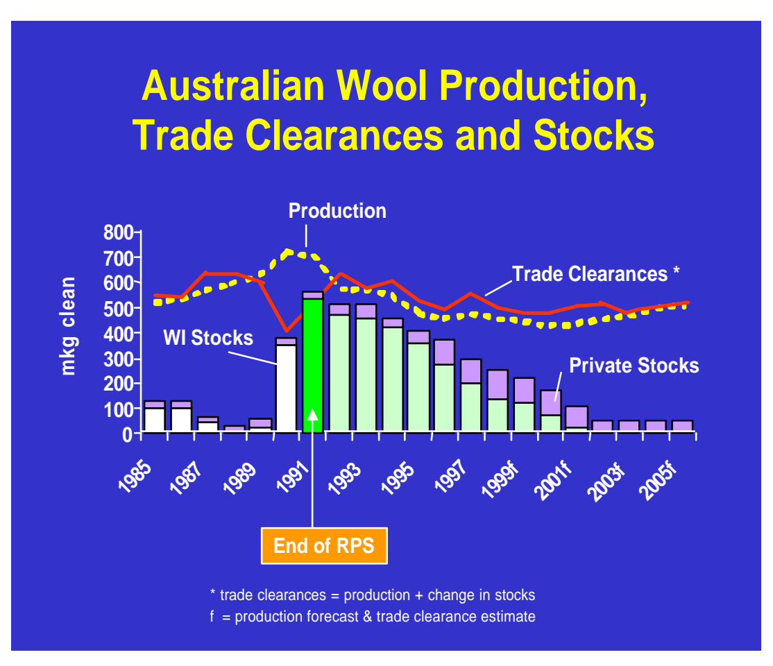
Figure 1: Supply and Demand for Australian wool (and the RPS) 1985–2005.

As world economies grew strongly throughout the 1980s and commodity prices improved, the price of wool also increased towards the end of the decade. In response to this rapid rise in prices, the level of the reserve price was raised 27% in 1987–88, and then a further 35% in 1988–89 to 870 cents per kilogram (c/kg). The high prices and favorable seasonal conditions led to a marked increase in production.