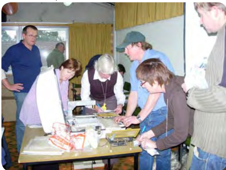
Checking out wool fibre sampling.