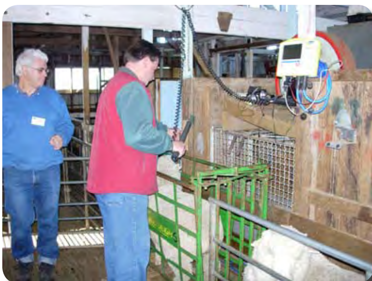
E-tagging sheep at Cressy Research & Demonstration Station