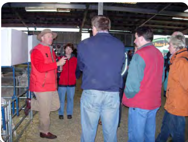
Chatting with industry leaders at Campbell Town Show.