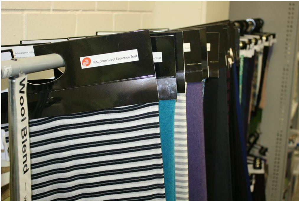
Fabric samples, funded by AWET, on display at the Adelaide College of the Arts.

The Trust held its annual meeting with representatives of the Fashion and Design schools in July 2012, continuing the strategy initiated in 2008. Key AWI staff also attended and participated actively.